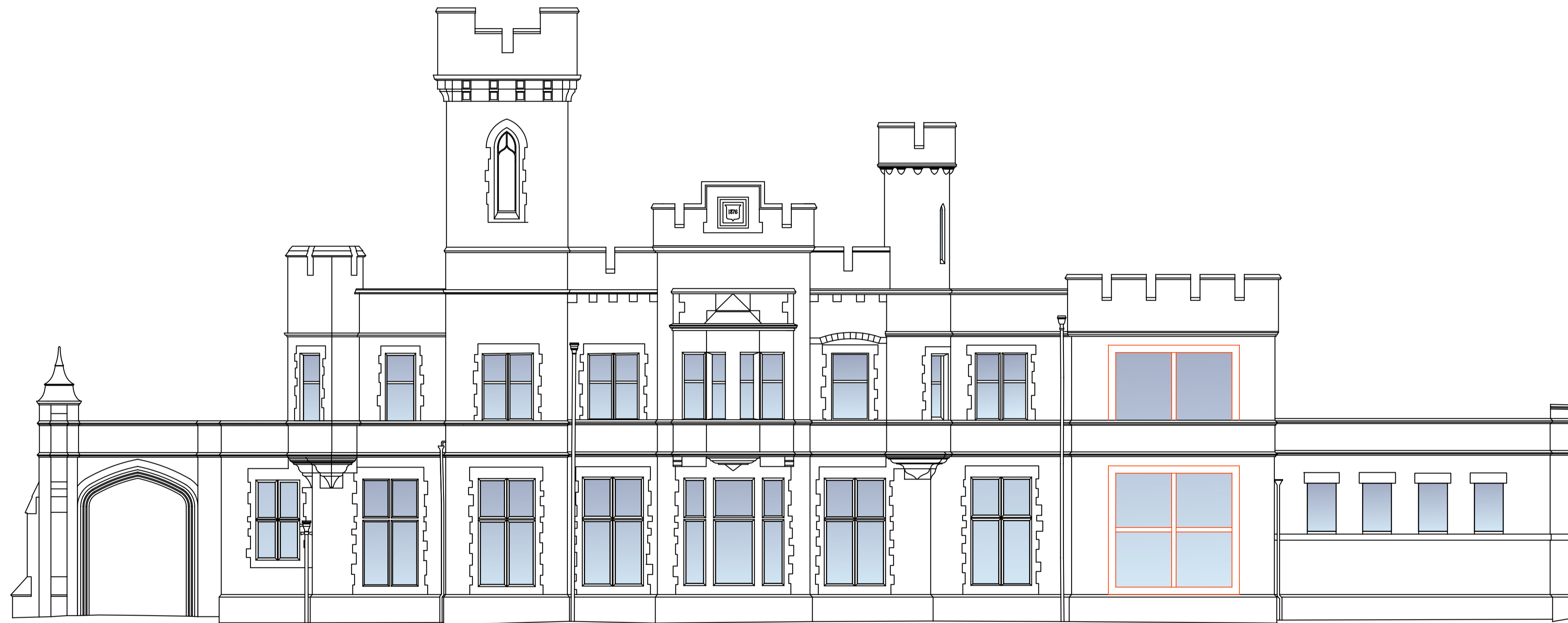
ELEVATION 1 SCALE 1:200 ▼ 55.00m