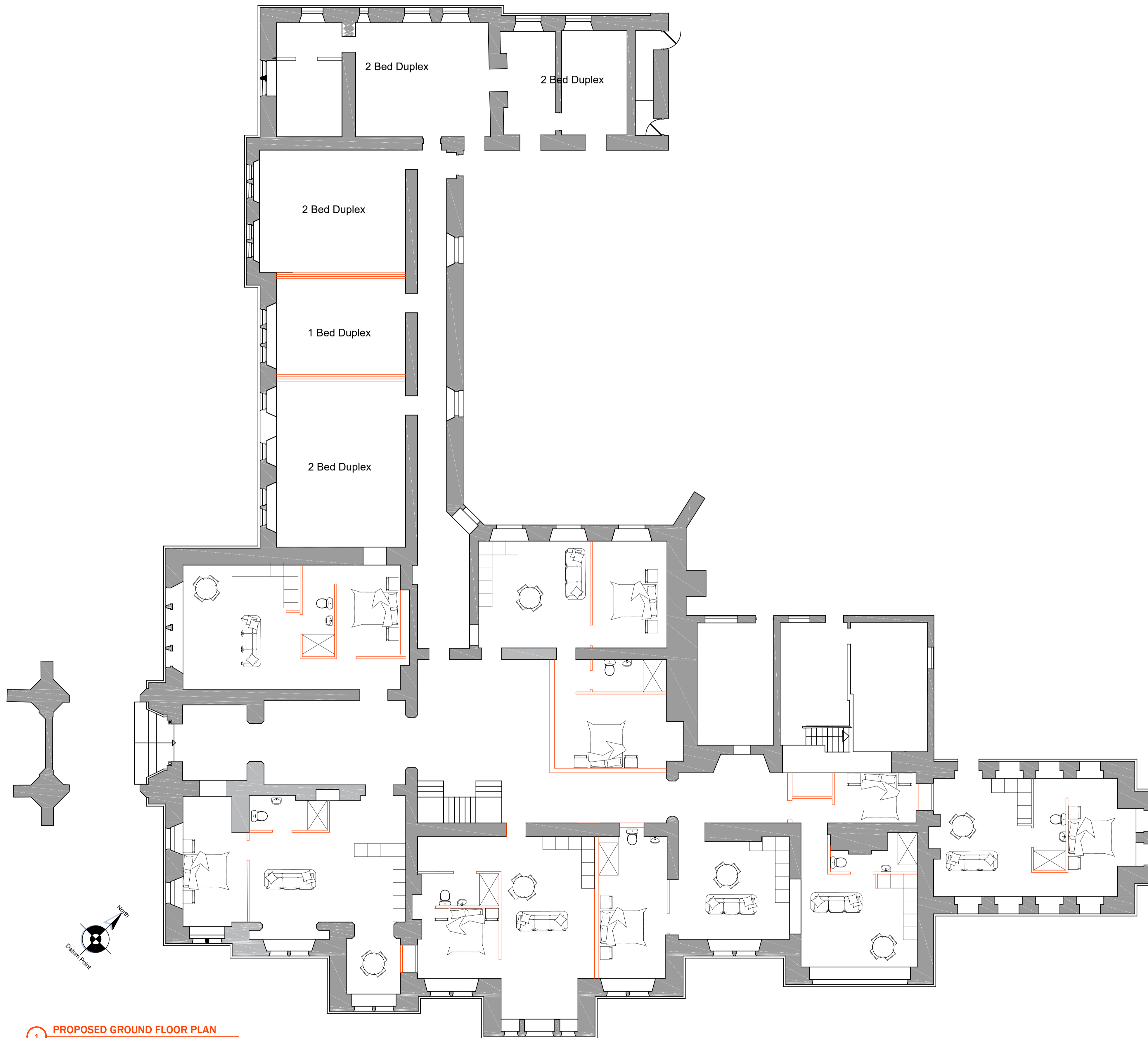
1 PROPOSED GROUND FLOOR PLAN SCALE 1:100